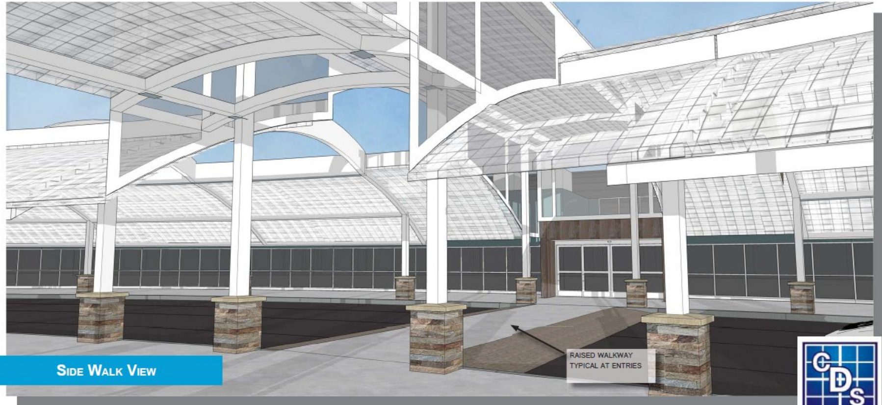
SIDE WALK VIEW